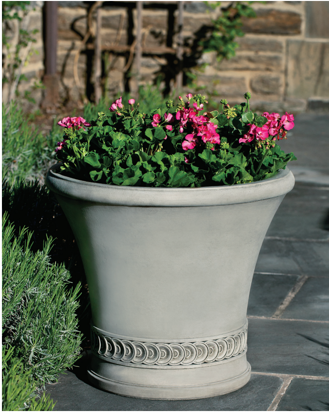
Shown in Greystone

Available in a choice of thirteen (13) exclusive natural pigment stains in addition to natural. All of our patinas are hand applied in a multi-step process which produces unique and beautiful surface finishes. Designed to replicate the look of naturally aged materials, the patinas will not prevent the natural aging process that occurs in an outdoor environment. Rather than creating uniform stains, our approach gives our products their unique beauty and appeal.