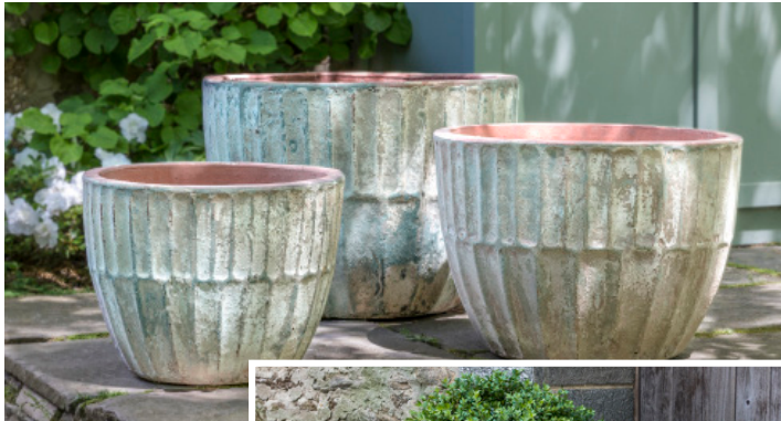
Shown in Vicolo Terra