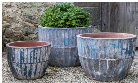
Shown in Vicolo Mare