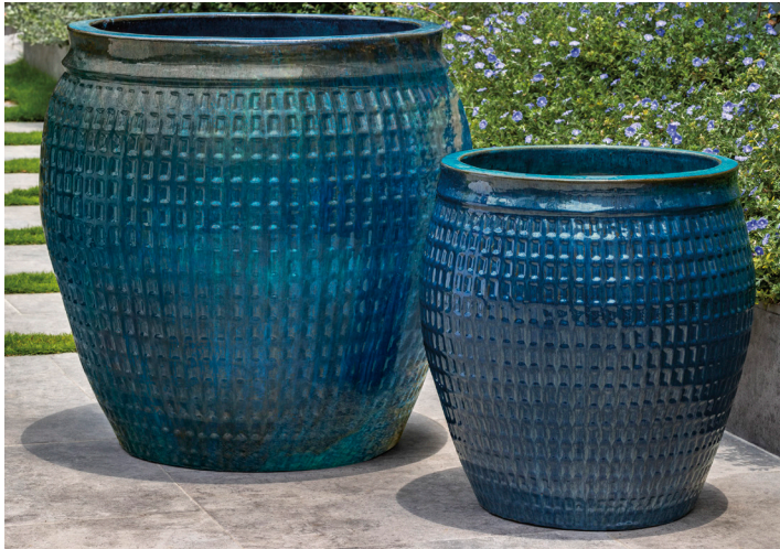
Shown in Mediterranean Blue