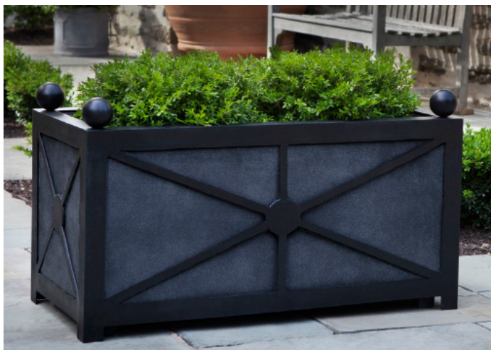
Shown in Lead

Lite® planters are rated for both indoor and outdoor use and frequently specified for rooftops and terraces, hospitality projects, public space installations, and restaurants. They are a great choice for jobs that do not allow for heavy-weight materials and where large scale plantings are required. Because of their light weight, fiberglass planters are easier to ship and material handle on the job. Fiberglass planters can withstand UV exposure and extreme temperatures, from high heat to frost and can tolerate the seasonal thaw cycles. Additionally, they won't corrode due to exposure or direct contact with soil. There is no need to use plastic liners with Campania's Lite® planters. Although we recommend that you take advantage of the quick turnaround of our stocked product; these shapes, finishes, and/or sizes are not always right for every job. Campania has the capability to produce custom shapes, sizes, and colors in our Vietnamese