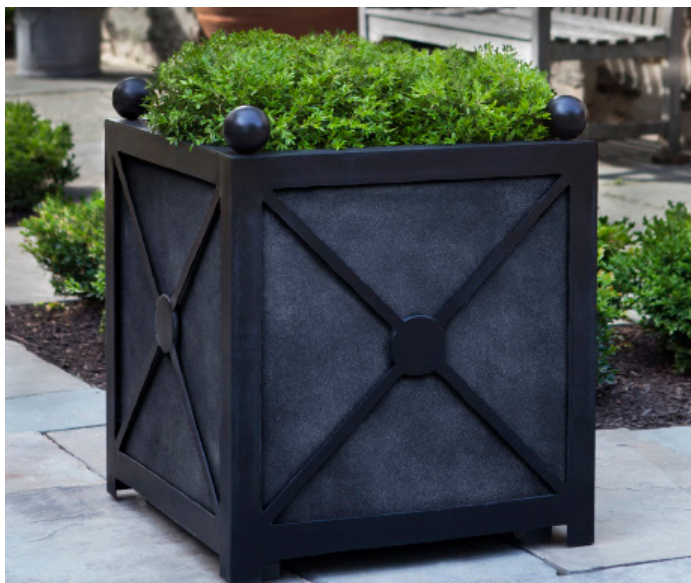
Shown in Lead