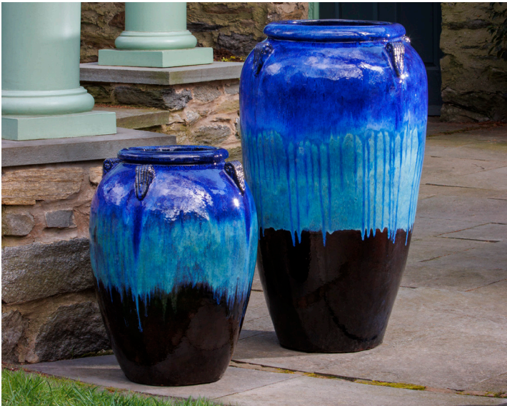
Shown in Running Blue/Brown