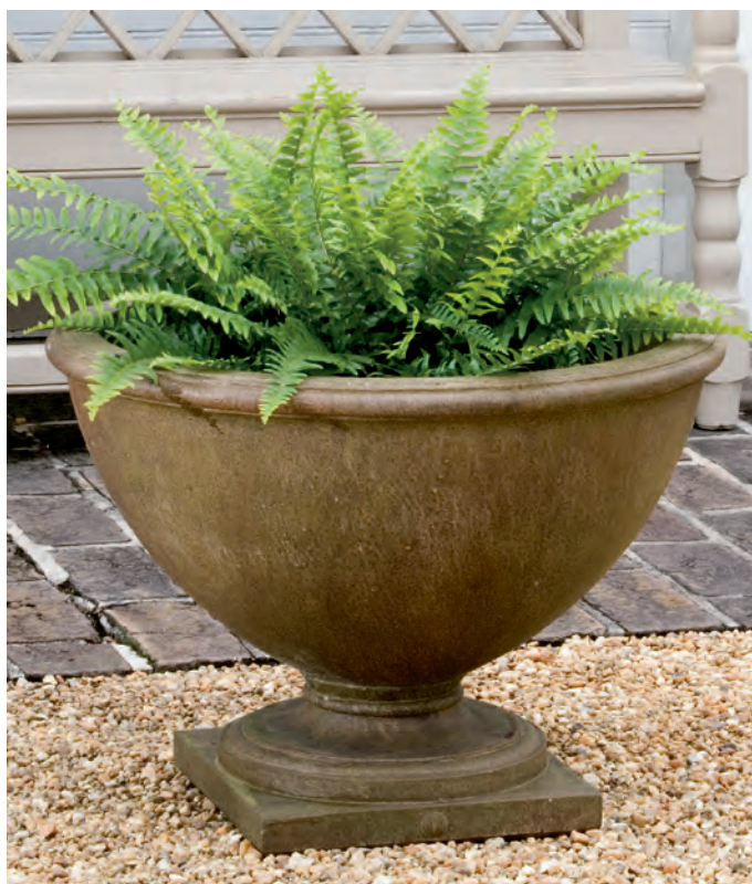
Shown in Aged Limestone

Available in a choice of thirteen (13) exclusive natural pigment stains in addition to natural. All of our patinas are hand applied in a multi-step process which produces unique and beautiful surface finishes. Designed to replicate the look of naturally aged materials, the patinas will not prevent the natural aging process that occurs in an outdoor environment. Rather than creating uniform stains, our approach gives our products their unique beauty and appeal.