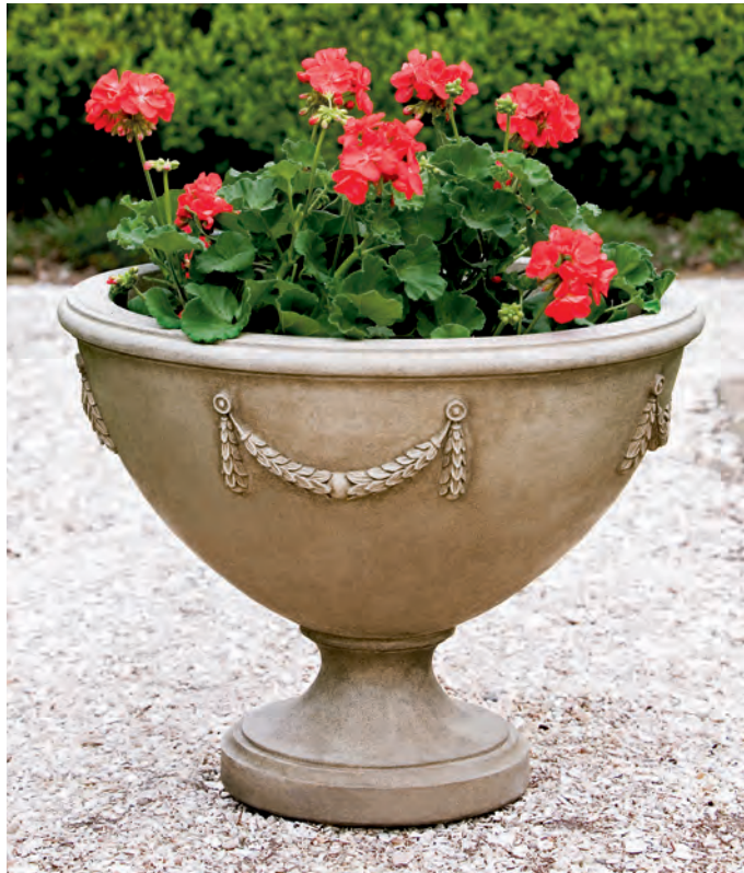
Shown in Verde