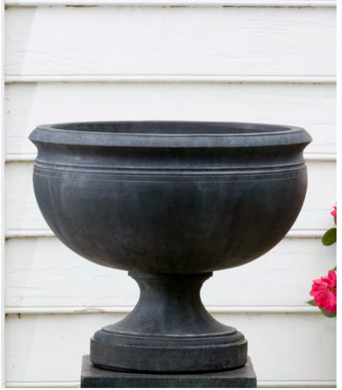
Shown in Nero Nuovo