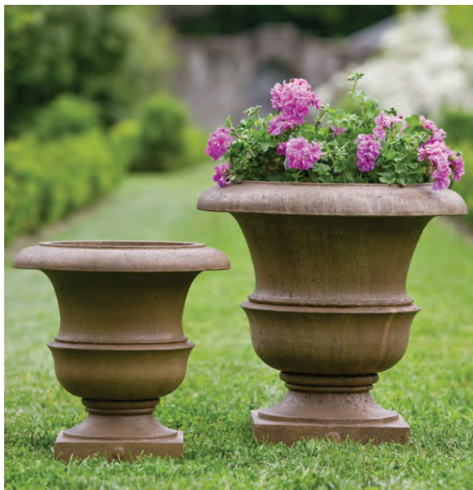
Shown in Aged Limestone

Available in a choice of thirteen (13) exclusive natural pigment stains in addition to natural. All of our patinas are hand applied in a multi-step process which produces unique and beautiful surface finishes. Designed to replicate the look of naturally aged materials, the patinas will not prevent the natural aging process that occurs in an outdoor environment. Rather than creating uniform stains, our approach gives our products their unique beauty and appeal.