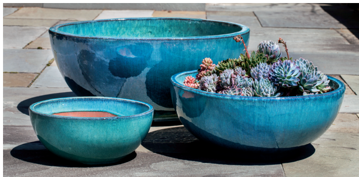
Shown in Aqua